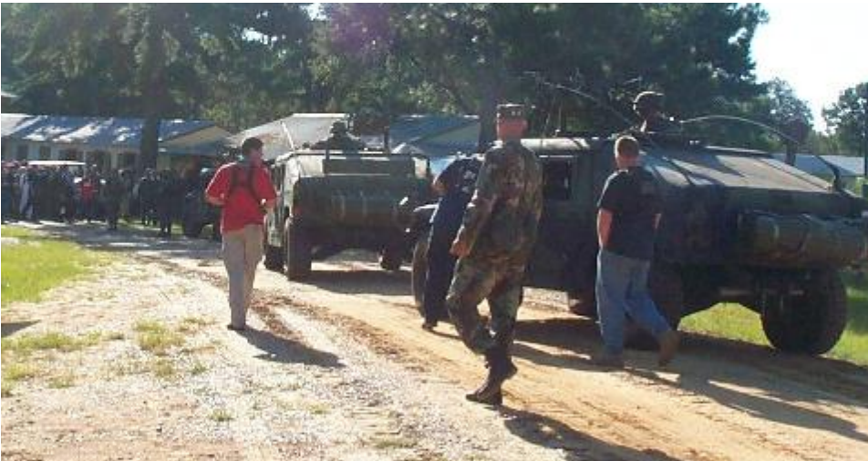
Soldiers from the 1 st Battalion conducting a Cordon and Search mission at Takira Village at JRTC. (AUG 2004)