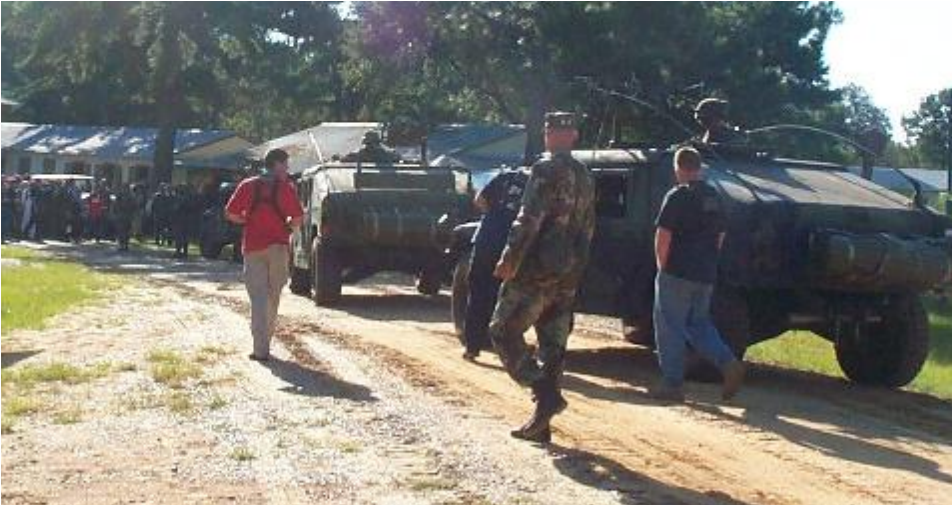
Soldiers from the 1 st Battalion conducting a Cordon and Search mission at Takira Village at JRTC. (AUG 2004)