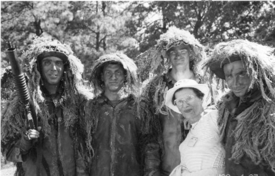
Above: American fighting men and a lady