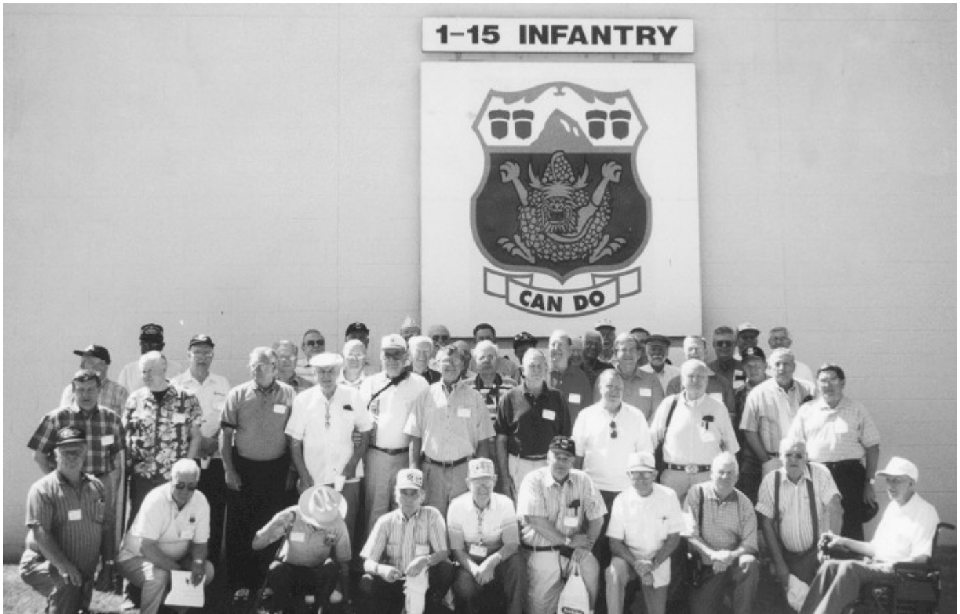
Old timers assembled outside 1st Battalion Headquarters