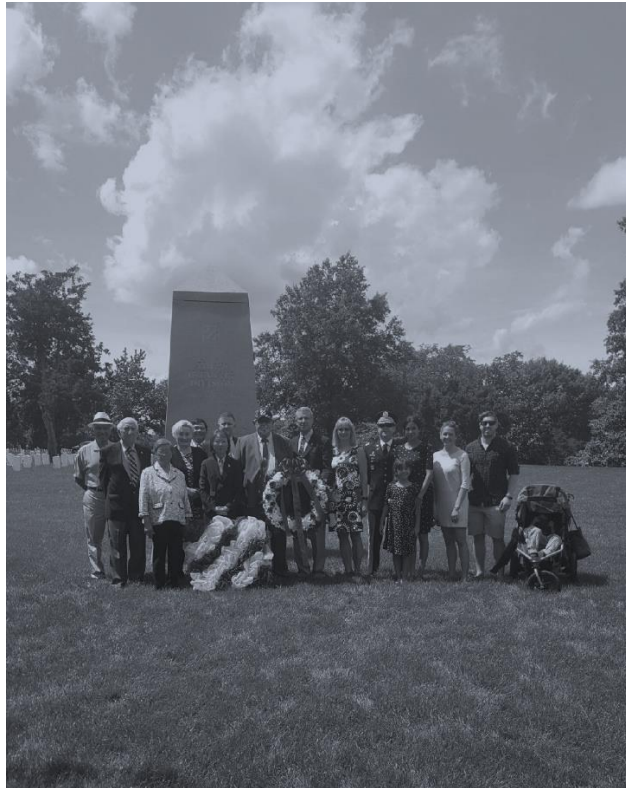
Association members participate in a Memorial Day wreath-laying ceremony at the 3 rd Infantry Division monument, Arlington National Cemetery